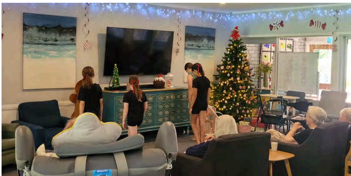
Youth group visit & performance