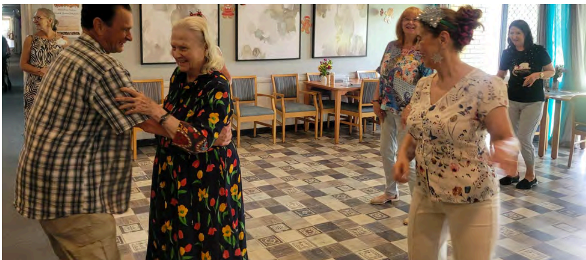
Christmas line dancing