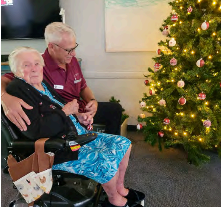
Christmas Tree decorating