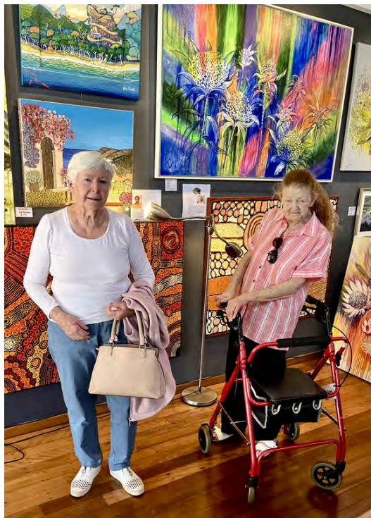
Out and about