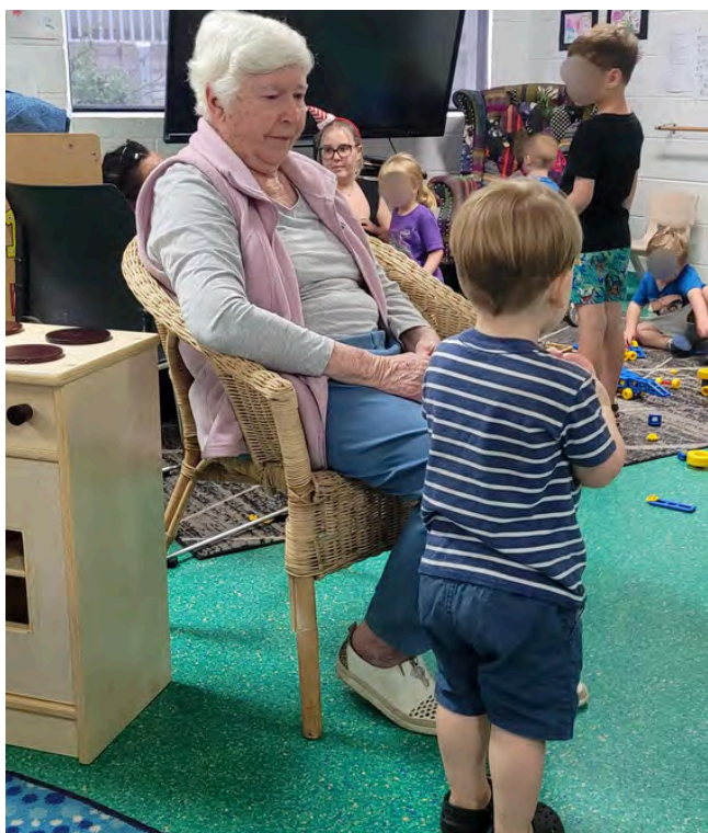
Goodstart Early Learning Visit