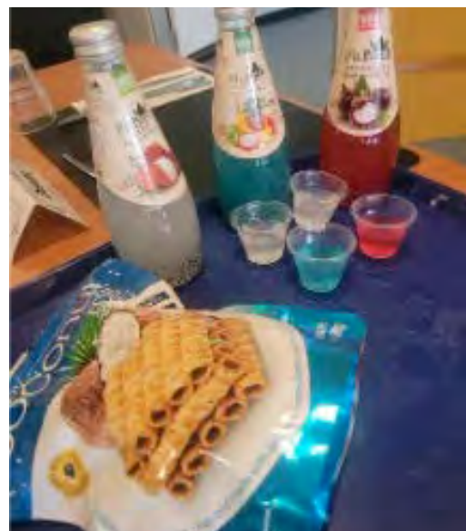
Armchair travel to the Philippines & food tasting!