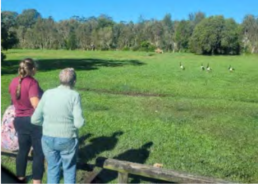
Goose and duck feeding