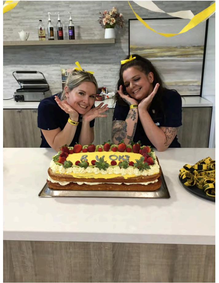
RUOK Day was supported with staff wearing yellow, along with a free morning tea of Cappuccino and cake from the kitchen.