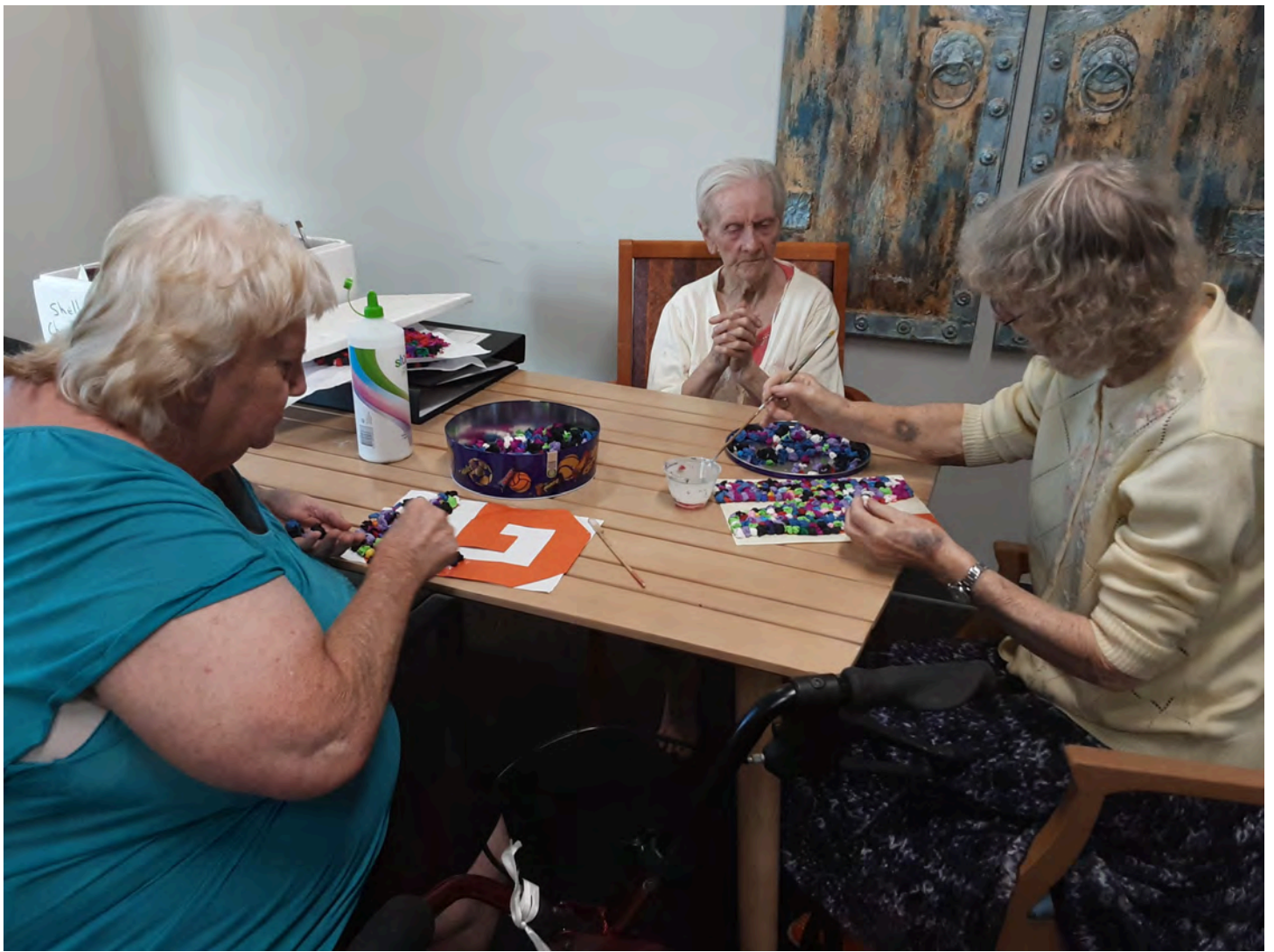
The ladies have been keeping busy with the sensory craft sessions in the afternoon, flower making and spring signs for the decorating of the dining room.