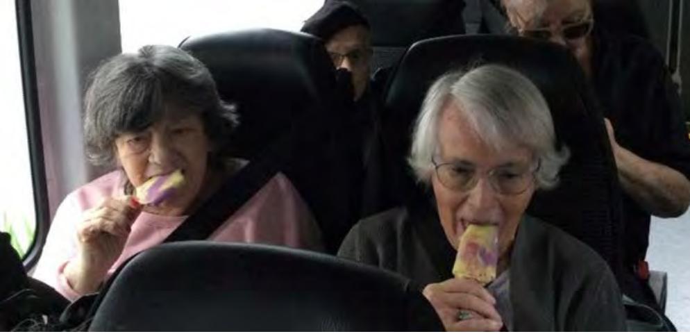
Scenic Bus Trip around the Mountain while enjoying an Ice Cream