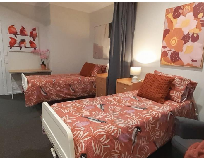
Payment options – Premium Companion Room + Ensuite Room size: 18 - 36sqm

100% Refundable Accommodation Deposit (RAD): $400,000 or 100% Daily Accommodation Payment (DAP): $91.83 or Combination Example: 50% RAD at $200,000 & DAP of $45.91