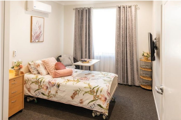
Payment options - Single Room + Ensuite Room size: 12 - 20sqm

Beaumont Care Kippa-Ring has four accommodation types that cater to a range of preferences, including private rooms and rooms for those who wish to live with a loved one or friend. There are a range of payment options for each of the accommodation types, including a one-off, upfront 100% Refundable Accommodation Deposit (RAD), a 100% Daily Accommodation Payment (DAP), or a combination of the two. The combination payments below are examples only, and you can choose how much of each portion you would like to pay. The below payment options are based on the maximum room prices and do not apply to government-supported residents.