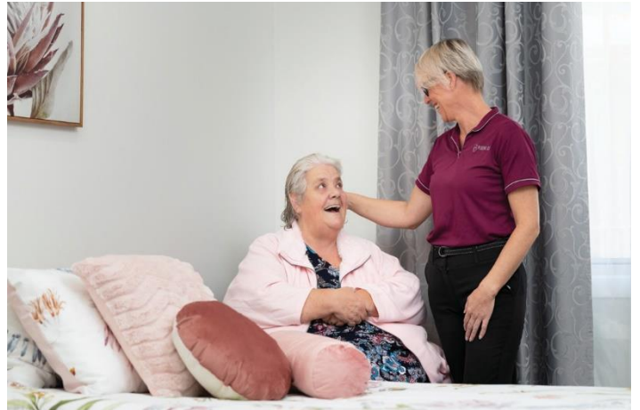
Payment options - Single Room + Shared Bathroom Room size: 10 - 18sqm

100% Refundable Accommodation Deposit (RAD): $450,000 or 100% Daily Accommodation Payment (DAP): $103.31 or Combination Example: 50% RAD at $225,000 & DAP of $51.65