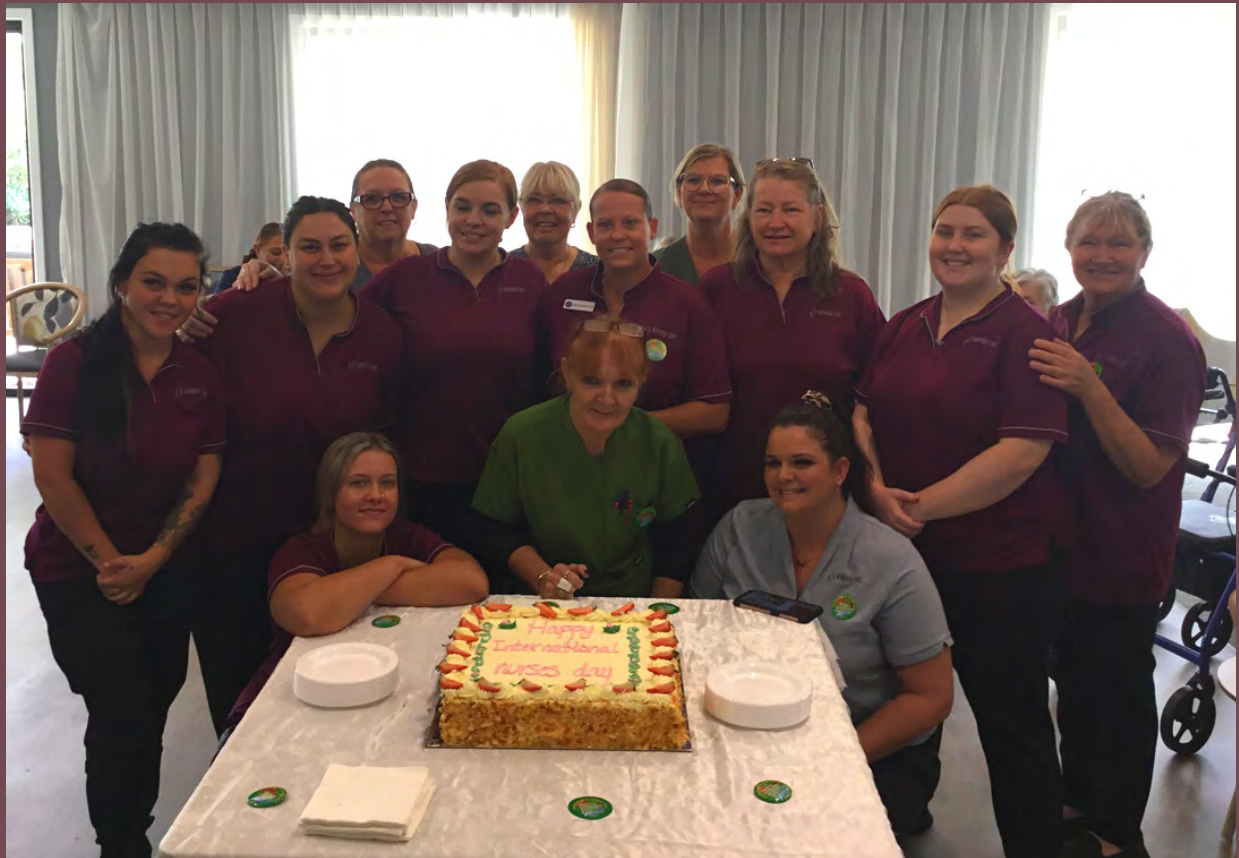
Staff celebrate International Nurses Day