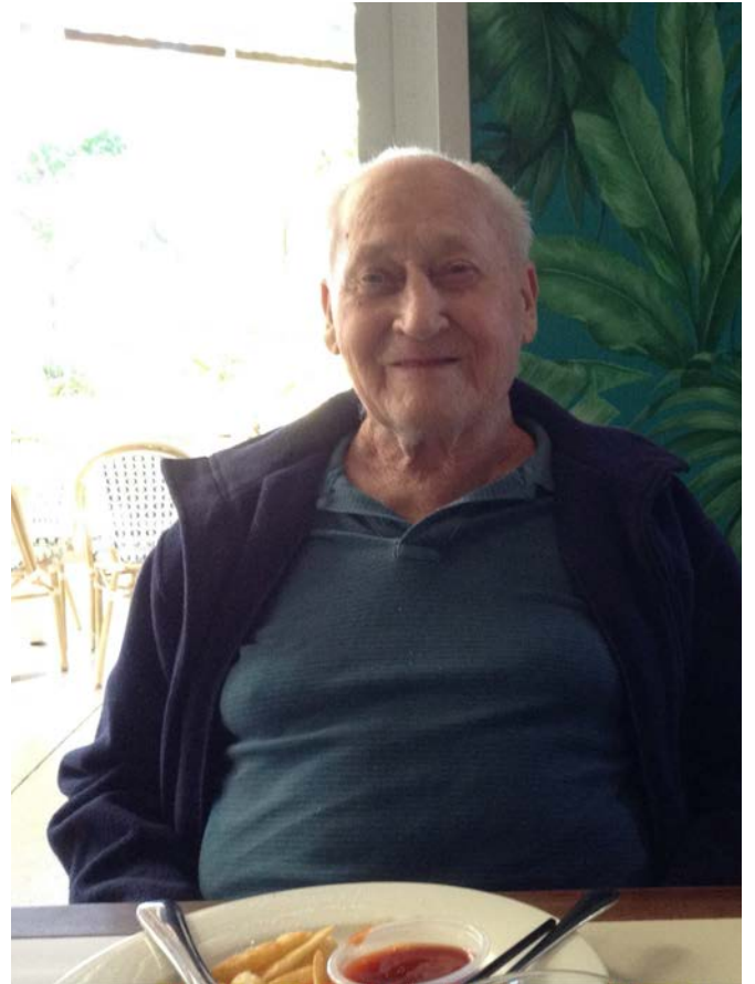
??, ??, ?? and Dot enjoy a meal at the beachmere tavern